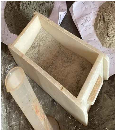
Fig: 2: Brick Moulds