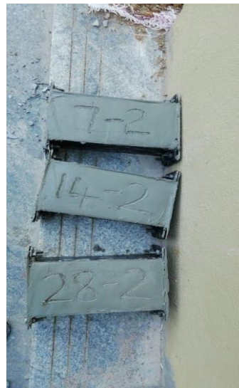
Fig: 3: Casted moulds