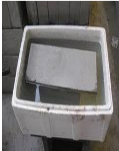
Fig: 4: Curing of Bricks