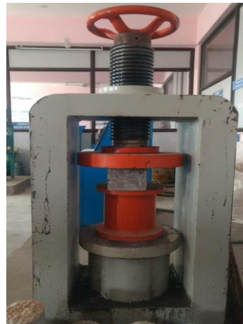
Fig: 5: Compression testing Machine

The brick samples were tested in a compressive testing machine having 2000kN, and landed at a constant rate of loading at 200kg per minute as per Indian standard procedure for the bricks. The Fig:5 below presents the Typical Compressive Strength machine. The specimen after being introduced in the Compression Testing Machine, the loading will be started. The maximum load at which the specimen fails is noted (KN).